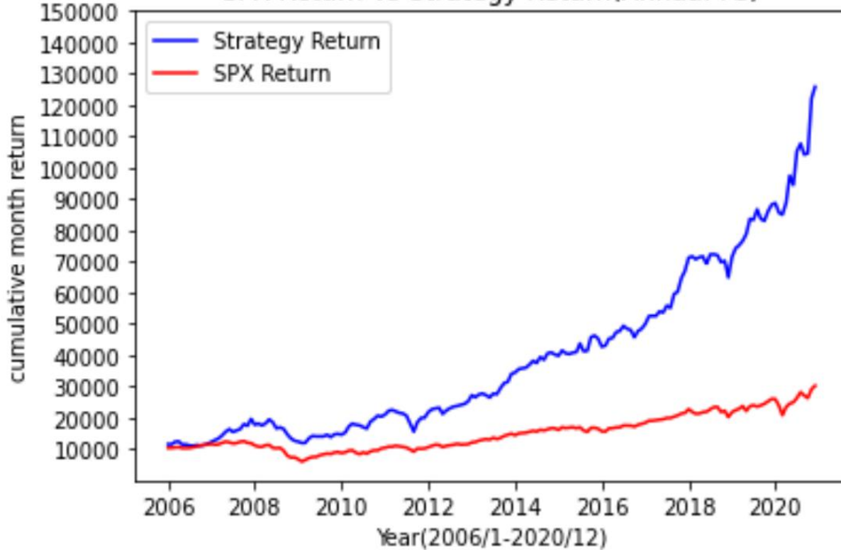
SPX Return vs Strategy Return(Annual-FS)